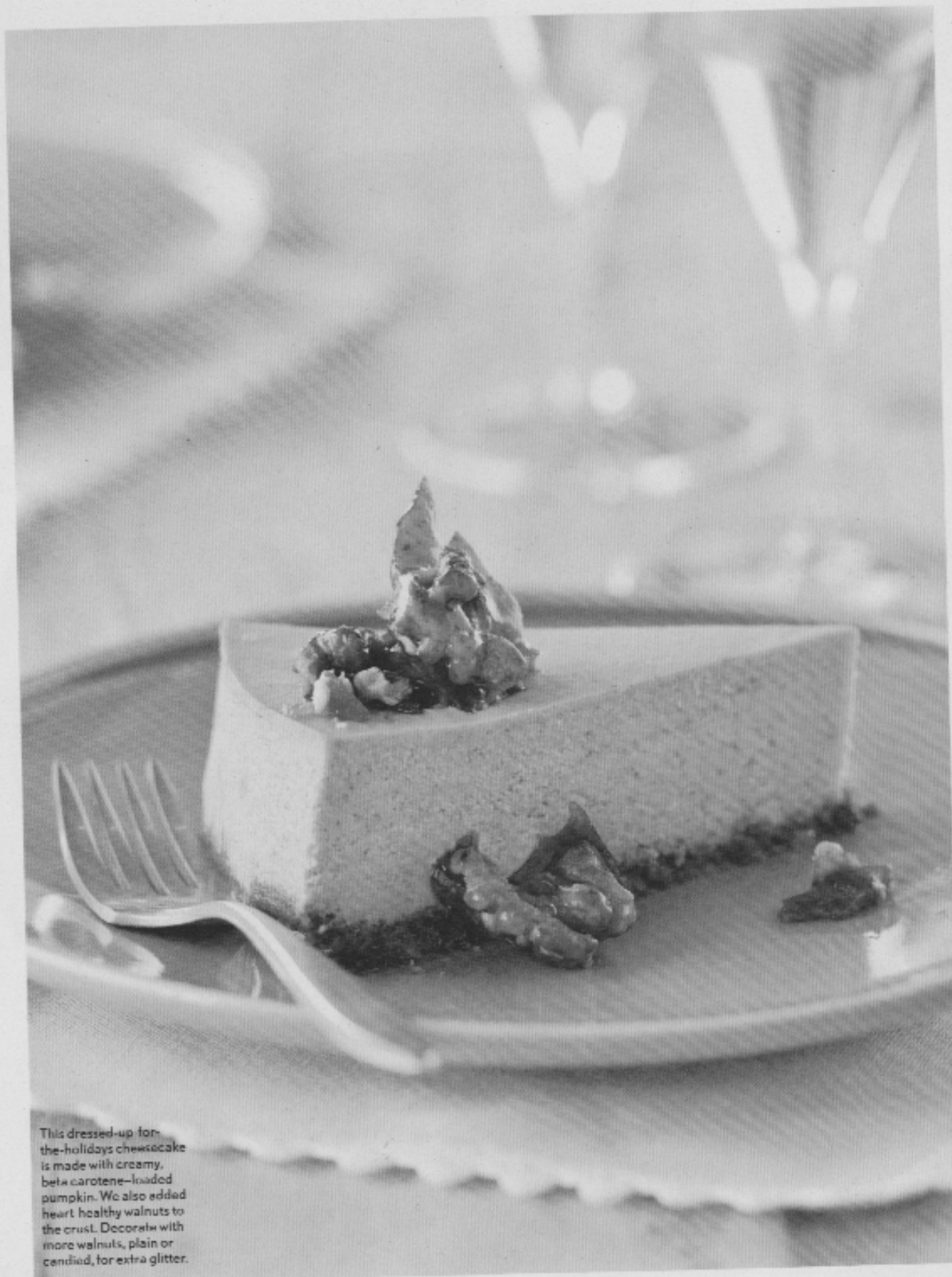
This dressed-up-for-the-holidays cheesecake is made with creamy, beta-carotene-loaded pumpkin. We also added heart-healthy walnuts to the crust. Decorate with more walnuts, plain or candied, for extra glitter.