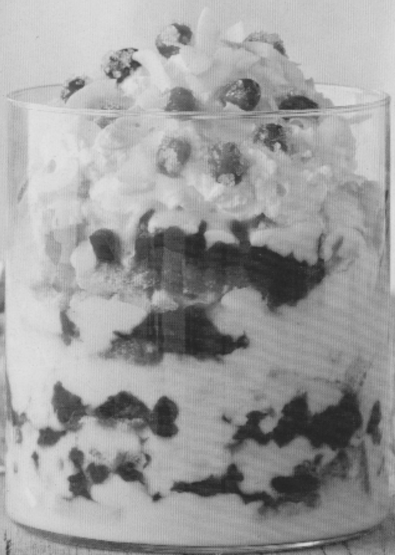
Cranberry Coconut Trifle