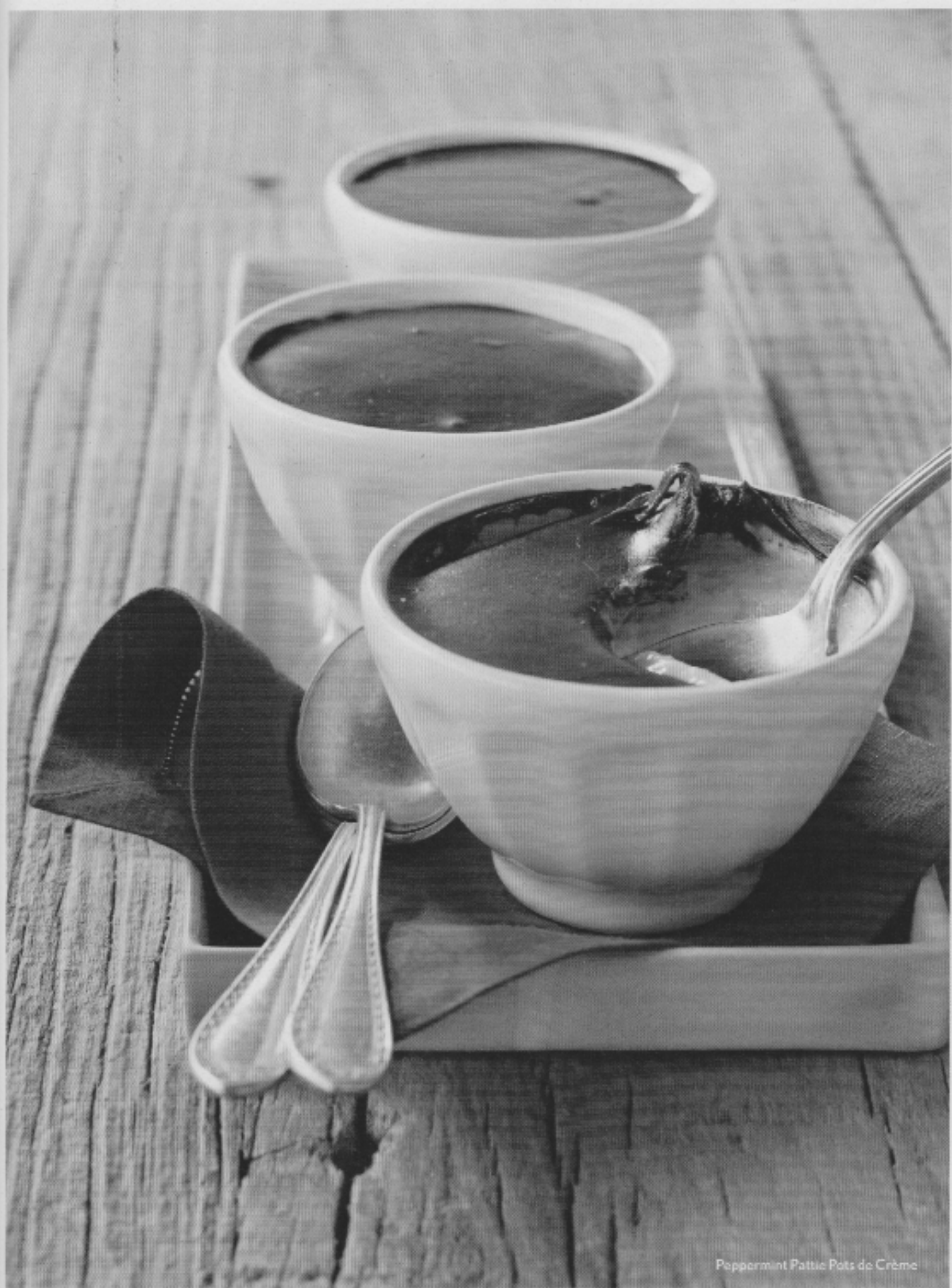
Peppermint Pattie Pots de Crème